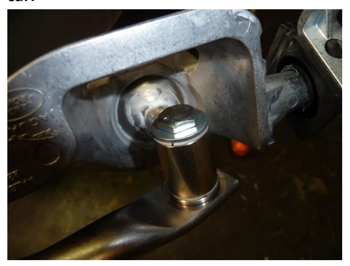
20. Fit all other parts back in reverse order, like exhaust shield, exhaust and shift boot/knob.

19. Fit the new bolt and wahser to connect the shift bar under the car.