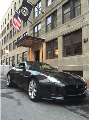
The Press Hotel