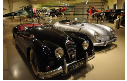
Owls Head Transportation Museum