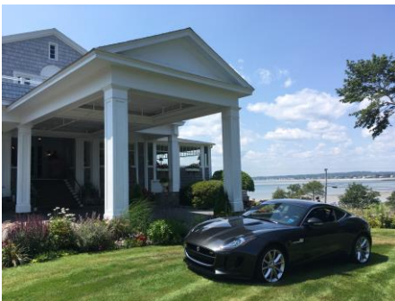
Black Point Inn