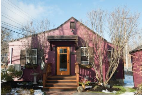
The Purple House