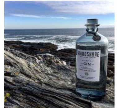
Maine Mead Works & Hardshore Distilling Company