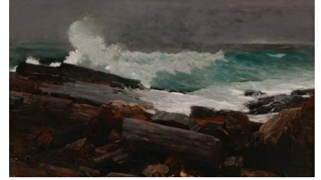
Winslow Homer Studio