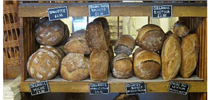
Standard Baking Co.