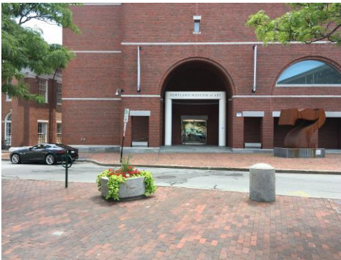
Portland Museum of Art