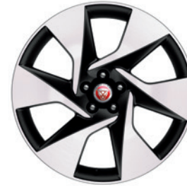
20" 6 SPOKE 'STYLE 6007' WITH DIAMOND TURNED FINISH 031MC