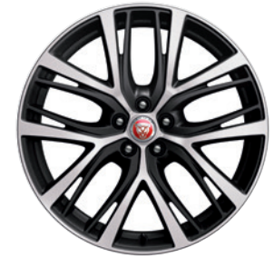
20" 5 SPLIT-SPOKE 'STYLE 5070' IN TECHNICAL GREY WITH POLISHED FINISH

Inside a choice of colourways, Ebony or Light Oyster, are available with an exclusive combination of a suedecloth headlining, Gloss Charcoal Ash First Edition veneer, carpet mats and First Edition branded metal treadplates.