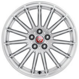
18" 15 SPOKE 'STYLE 1022' 029YH (Standard on S)