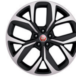
20" 5 SPOKE 'STYLE 5068' WITH DIAMOND TURNED FINISH 031QD (Standard on HSE)