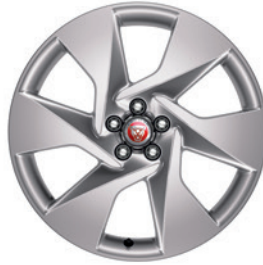
20" 6 SPOKE 'STYLE 6007' 031MB (Standard on SE)