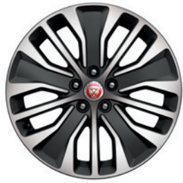
18" 5 SPOKE 'STYLE 5055' WITH DIAMOND TURNED FINISH 031TC