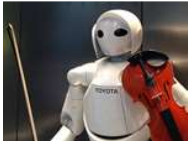
Violin playing robot