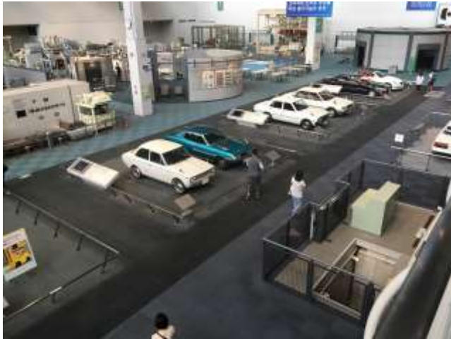
View of the Automobile Pavilion

I spent over 2 hours wandering around the various exhibits and could have spent longer if time permitted. I can recommend it to any car lovers or anyone interested in technology in general.