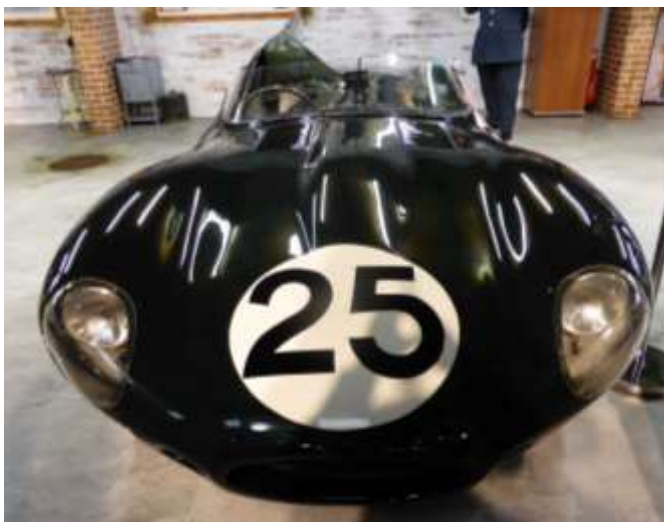
Famous D-type at the 2016 Good Revival

XKD 605 with that penultimate long nose D-type built in March 1956.