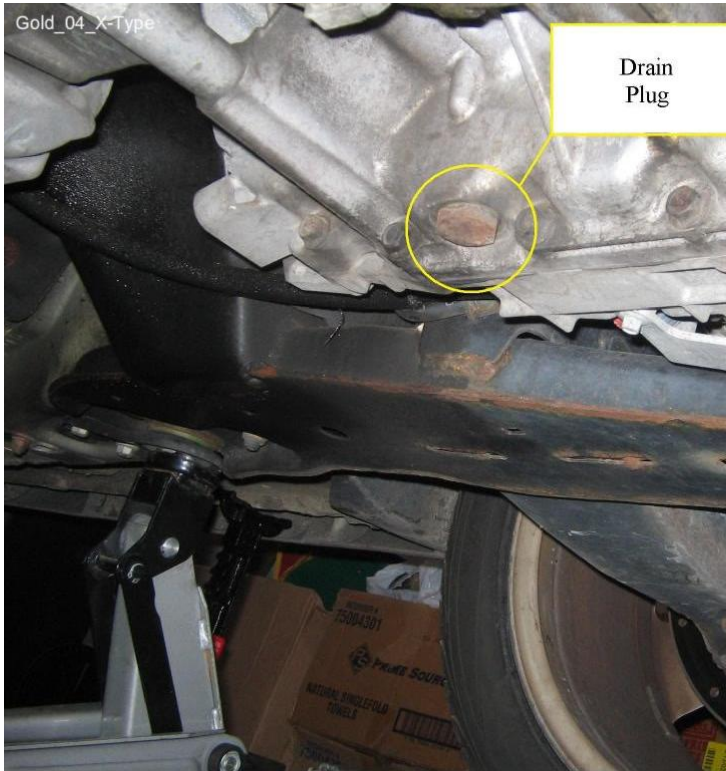
1. Transmission Drain Plug (bolt)

Here are some pictures to help locate the drain, fill, and level check plugs: