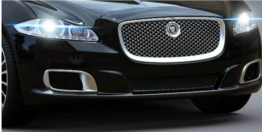
European model shown