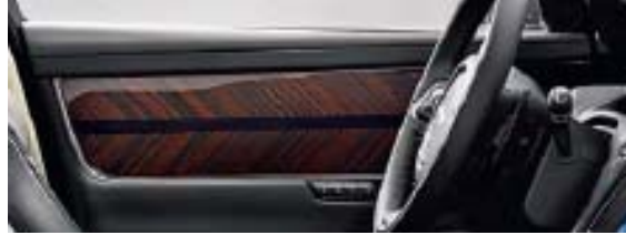
Wood & leather steering wheel not shown

The XJL Ultimate is fitted with a new exclusive handcrafted "Herringbone" veneer. Note: In the US, the XJL Ultimate gets a heated wood & leather steering wheel in piano black veneer, matching the door veneer style.