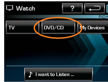
DVD menu soft keys