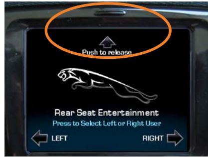
Dock or undock

Operating note. The touch screen remote control can operate while docked or undocked.