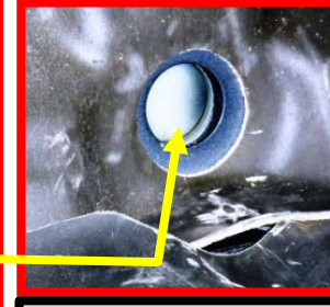
Drain Hole Through Firewall exits just above transmission housing