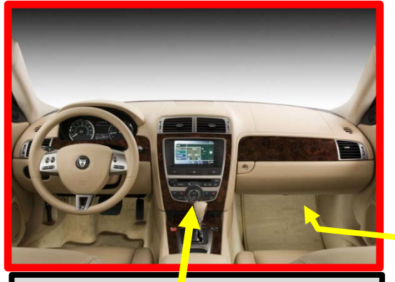
Starting Point – Similar Car