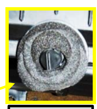
Duck bill Hose showing through the sealing material that seals between the AC Drain hole and the vehicle firewall.