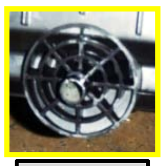
Drain Hole from Evaporator with the Duck Bill Hose and Sealing removed..