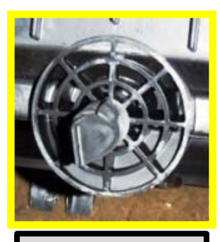
Duck bill Hose with the sealing material removed. (Duck Bill Design to prevent insects coming into the car?)