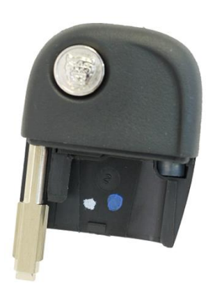
Lower portion of Key Fob

Upper portion of Key Fob with flip out key blade. Notice about 1/8 inch of the transponder showing At the right edge in the middle. It is wrapped in A silicone tube.