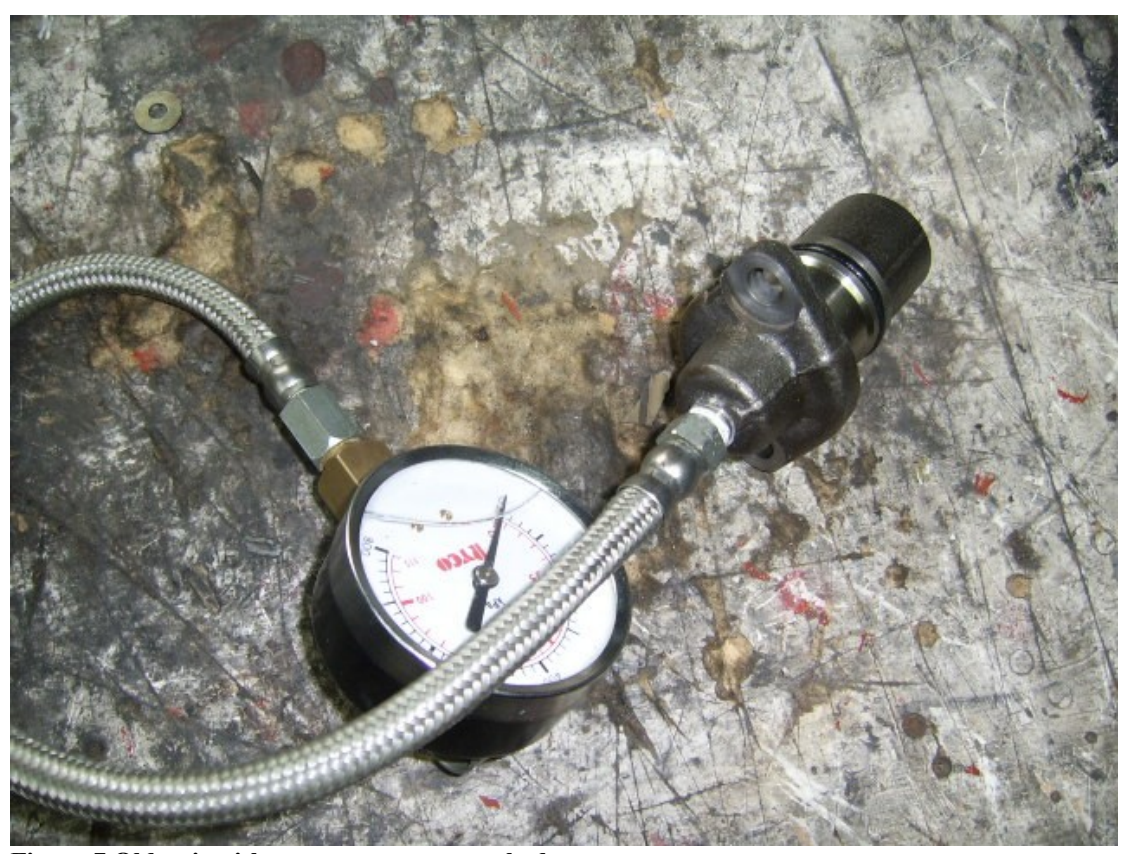
Figure 7 Old unit with pressure gauge attached

I am NOT convinced I found anything, but at least now I/we have oil pressure readings at the tensioner. This pressure is slightly higher than I had at the oil filter housing, BUT, that was done some time ago and the engine was due for an oil change, and this time the oil is only 1000km old, and I accept these figures as true for my engine. Pretty damn good in anyone's opinion I reckon.