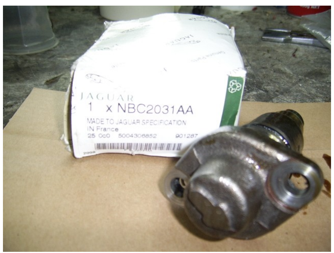
Figure 1Tensioner as received

assembled it as it came from Jaguar, deciding the OLD unit was incorrectly assembled by some previous unknown and refitted the thing to the car, started the engine and once the initial "unholy rattle" disappeared, the annoying rattle was no more, too good to be true, I am NOT that lucky, went for a drive, no more rev range rattle, parked for a quiet beer under a shady tree, and about 30 minutes later fired it up, NO rattle, fair dinkum, this thing always gave that "ching" at hot start, but no more, drove home, waited again, started it again, and again, all quiet, consumed much beer, then typed this.