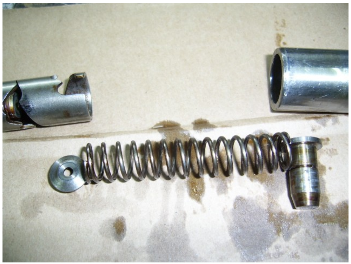
Figure 6 This is the INCORRECT assembly

Picture "1" shows the unit as received from Jaguar, including the box with the latest Part No.