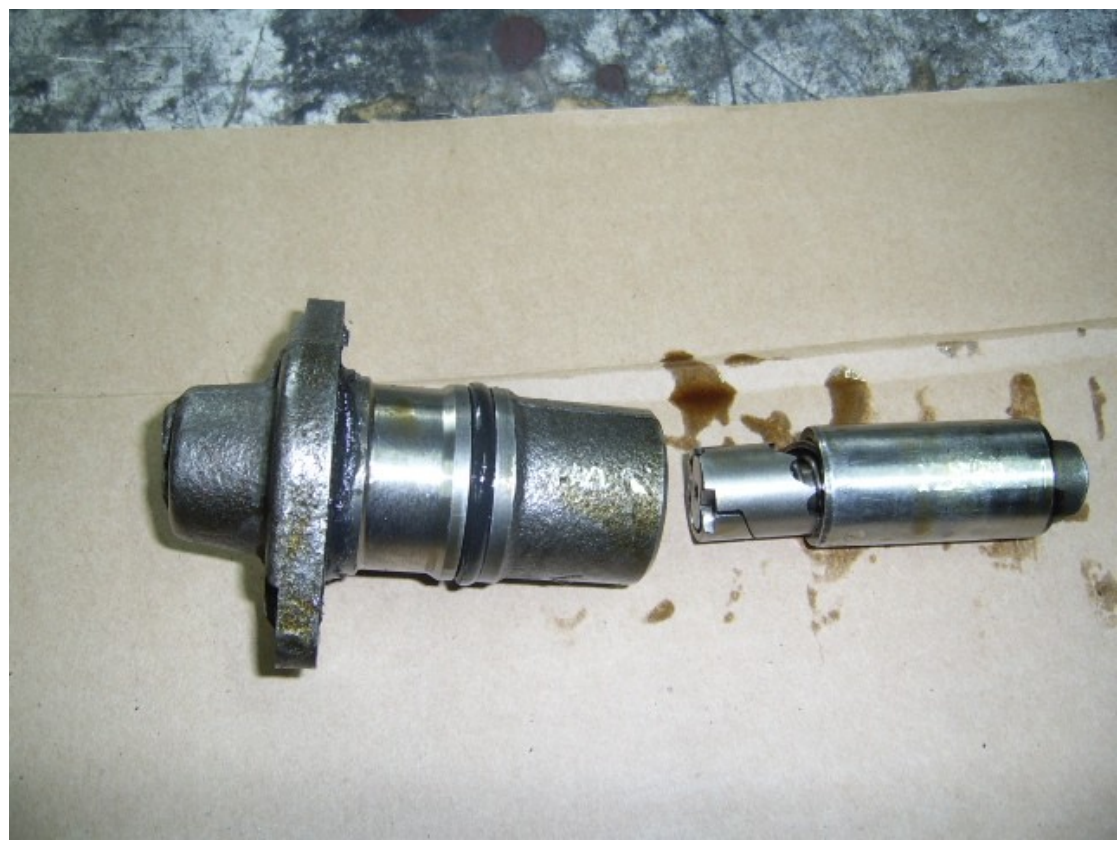
Figure 2 The 2 main components, spring loaded plunger on the right.