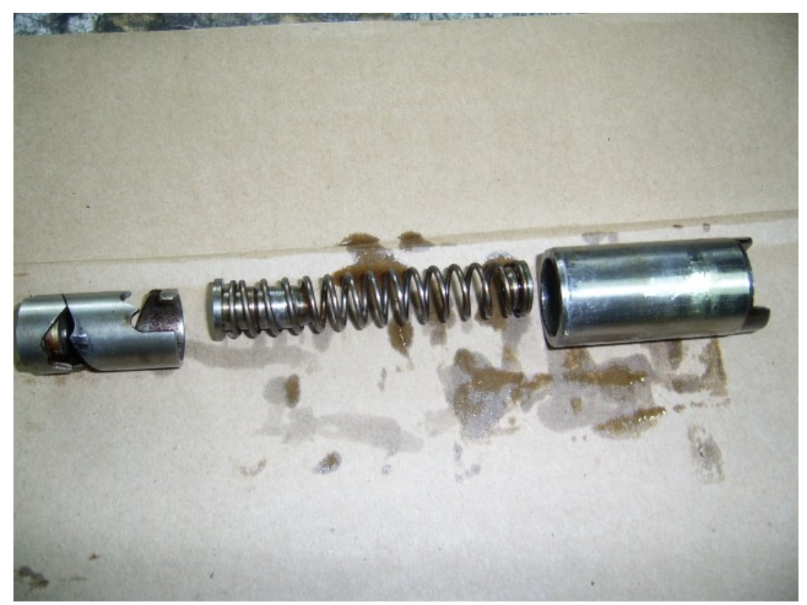
Figure 4 Spring assembled correct as supplied from Jaguar.