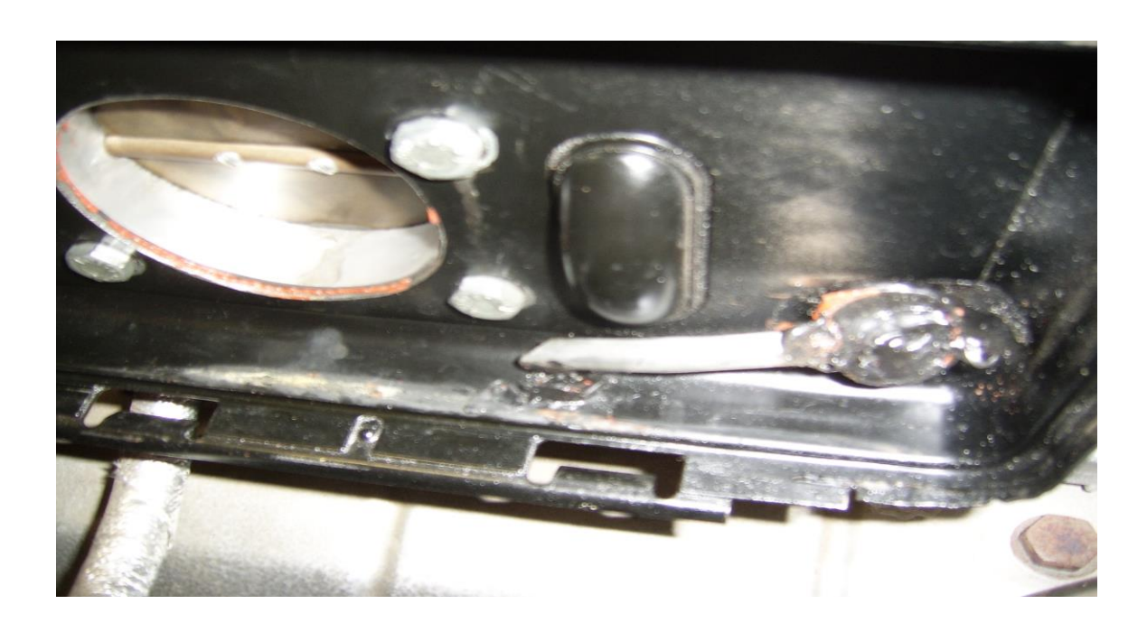
Inside the LH air filter showing the dist cap vent pipe