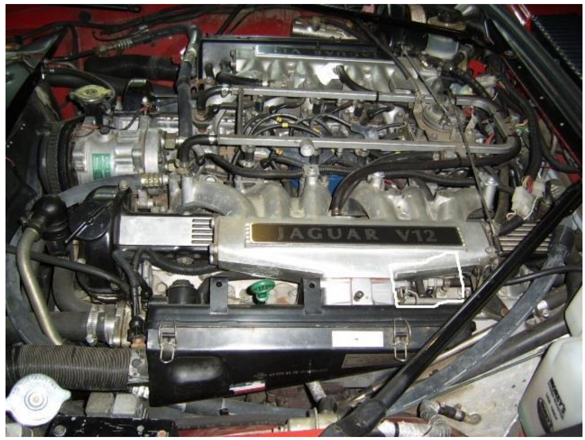
Figure 1 Just showing 1 cold start solenoid inside the White square