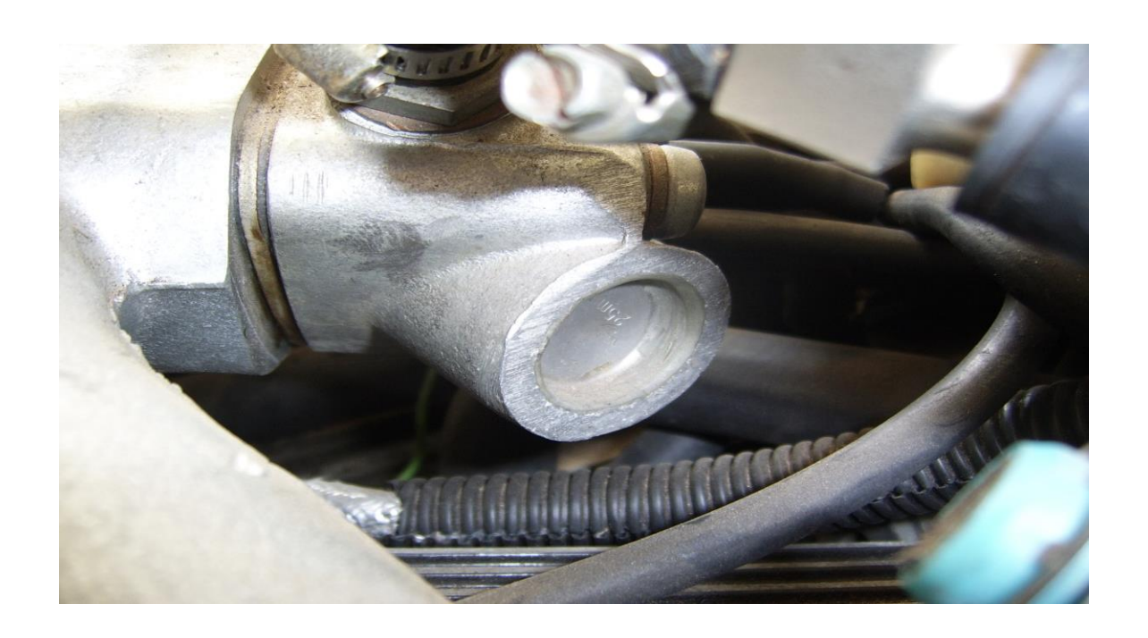
RH end plate with plug inserted