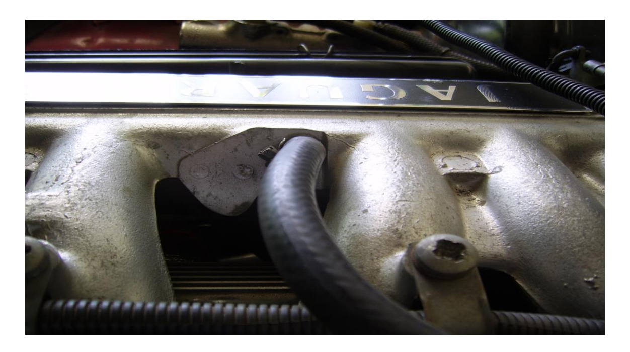
ECU take off point