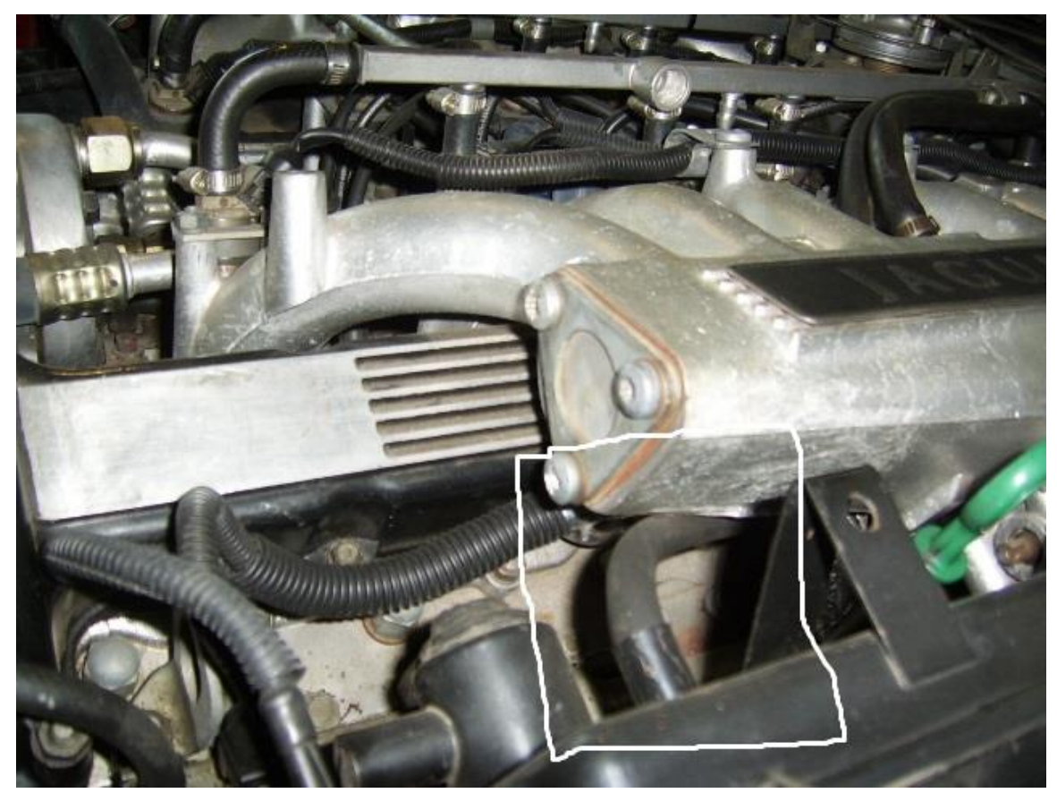
Figure 2Solenoid air intake.