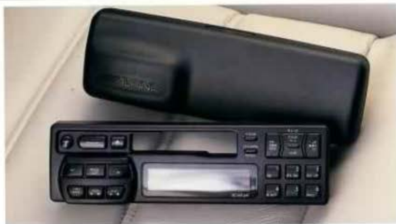
A detachable front panel for the audio system is an effective anti-theft provision.

nighttime operation without the need to divert attention from the road.