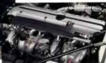
A new intake manifold offers improved sealing. The fuel injector rail (under the black housing) is now covered to give the engine compartment a cleaner look.

On Board Diagnostics (OBD, or OBD II in California), yet it also offers advantages to buyers. For example, the AJ16 is fitted with knock sensors to assure optimum ignition timing and low emissions. This also provides greater tolerance for variations in gasoline octane ratings, reducing engine noise and helping to avoid engine damage in the event of poor fuel quality. Of course, exclusive use of premium fuel continues to be recommended.