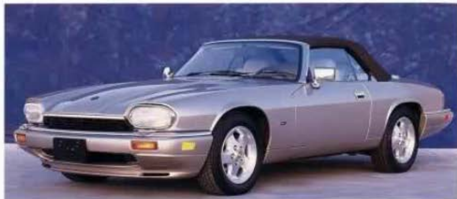
1995 XJS 4.0L Convertible

The major mechanical changes in the XJS 4.0L are accompanied by modest visual changes. Still, the upgrades are noteworthy: Five-spoke, 16" diameter wheels with diamond-turned finish are now standard equipment and the OE tire is a Z-rated (that is, rated for speeds above 149 mph) Pirelli 4000E in the 225/60 size. The center cap of the wheel carries a silver growler on red background, and the leaper badge on the front fender sports a matching red background.