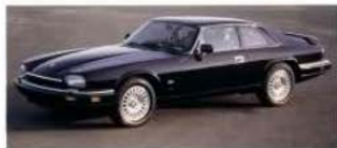
1995 XJS 6.0L Coupe

feel (see chart inside back cover). The natural grain Autolux leather will be available in seven colors as standard equipment on V12 cars.