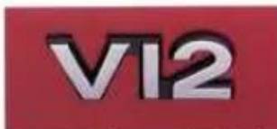
The 6.0L XJS is readily identified by the silver-tone V12 emblem on the lower front fender.