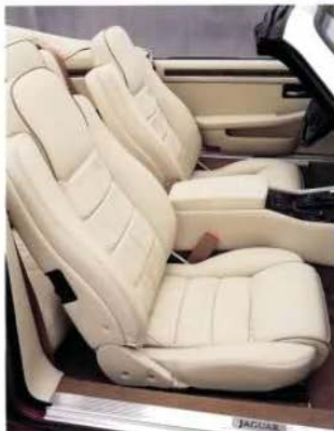
Autolux leather seats in the 6.0L models are upholstered in a four-panel design with rucked center panels, contrast piping and stitching.