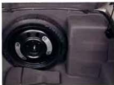
The space saver tire is now mounted on a steel wheel. (Shown with cover removed.)

Optional Equipment: Five-spoke wheels in chrome finish DI will become available after initial product launch.