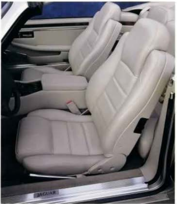
Seats are upholstered in a new four-panel pattern.