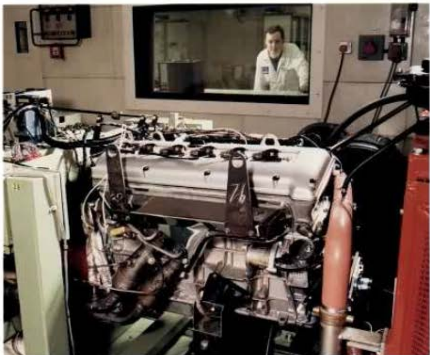
Testing on the engine dynamometer verified the durability of the new 237hp AJ16 engine.

The improvements in product quality are the result of many factors, from the redesign of vehicle components to the updating of manufacturing facilities