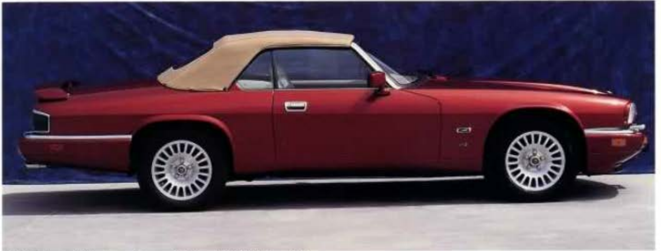
Beige is one of five top colors available on 1995 XJS Convertibles.