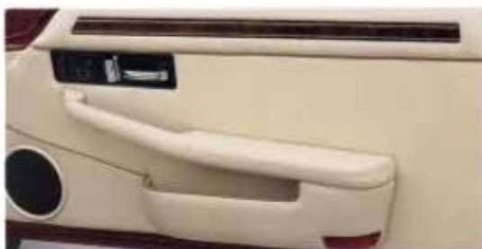
Door casings of 6.0L S-types are finished in Autolux leather (including speaker grille bezels) with contrast piping in place of previous chrome strips.