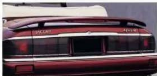
The high mount stop lamp is incorporated into the rear spoiler of 6.0L models.