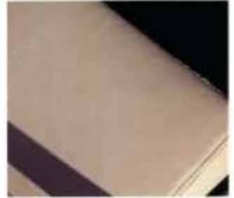
Shallower grain leather offers a more supple feel.