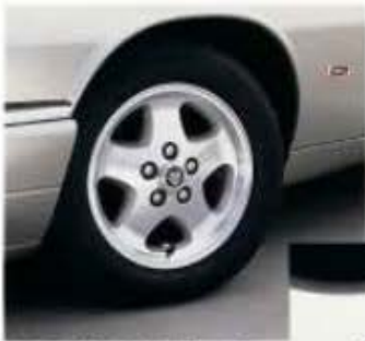
The XJS 4.0L is fitted with 16-inch wheels—a five-spoke design with diamond-turned finish.