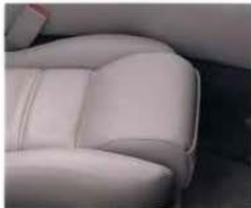
A handy storage pouch with elastic closure is found on the forward edge of each front seat.

All 1995 S-types will be pre-wired for a cellular phone. Additionally, the tread-plate which covers the door sill is now formed in aluminum, therefore less likely to show scratches than the previous stainless steel insert. In the trunk, a one-piece contoured carpet is fitted to provide a luxurious, well-finished appearance.