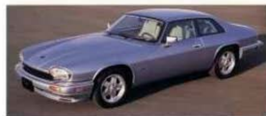
1995 XJS 4.0L Coupe