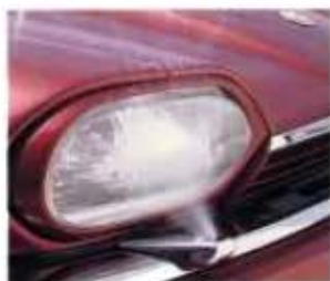
Headlight power wash is standard equipment on the V12 XJS.