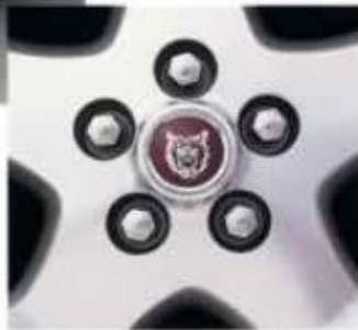
Wheel center caps coordinate with fender badges, displaying a silver growler on red background.

vertibles, the lamps located in the rear quarter casings now illuminate when the door is opened or when activated by the fascia switch.