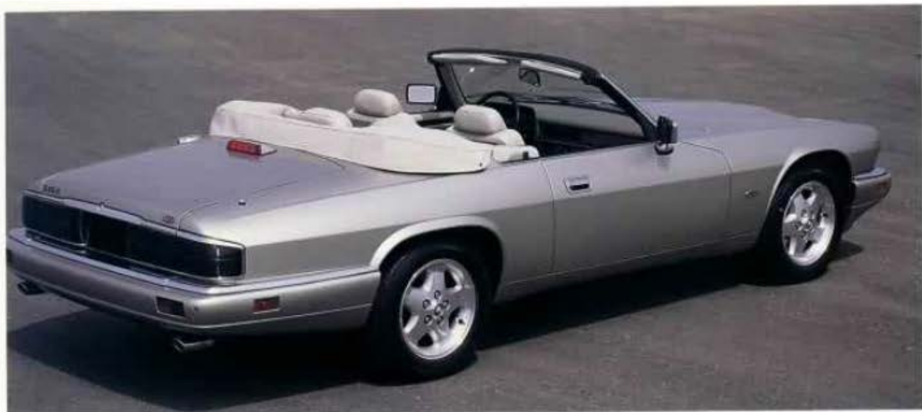
1995 XJS 4.0L Convertible