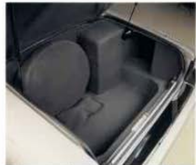
The trunk is luxuriously finished with a one-piece, contoured carpet.