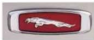
The 4.0L fender badge is highlighted by a silver leaper on a red background.