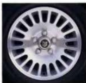
The 20-spoke wheel with diamond-turned finish is standard equipment on V12 S-types.