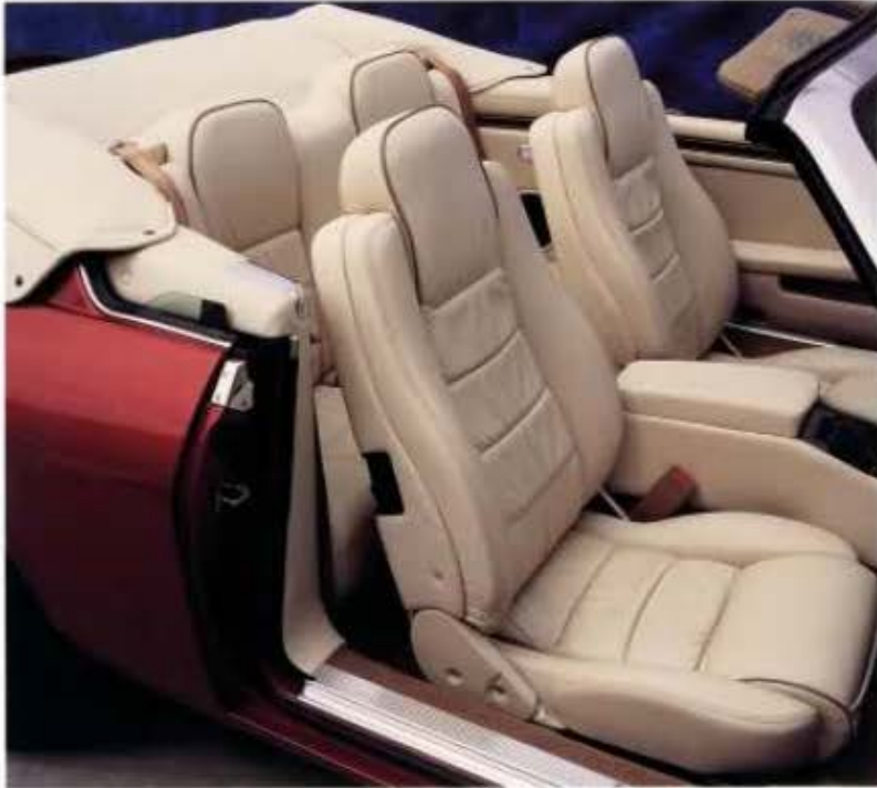
Fine Autolux leather graces the interior of the 6.0L S-type.