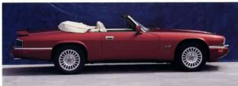
1995 XJS 6.0L Convertible

The range of interior color choices has been expanded, and in response to customer requests, revised to include lighter shades that contribute to an open, airy