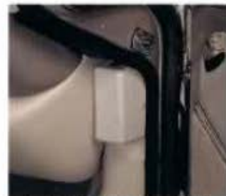
A redesigned inertia switch provides emergency fuel pump shut-off.