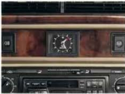
An analog clock is provided in place of the trip computer on the 4.0L XJS.