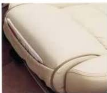
A convenient storage pouch is provided on the forward edge of each front seat.