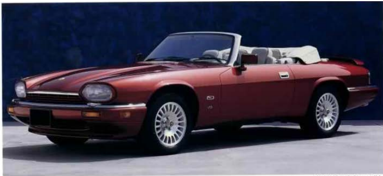
1995 XJS 6.0L Convertible