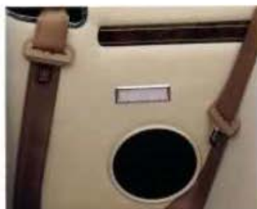
Rear quarter casings in V12 models are Autolux covered, feature contrast stitching, leather-trimmed speaker grille bezels.