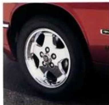
Chrome-finish five-spoke alloy wheels DI are an available option.

All 1995 S-types will be pre-wired for a cellular phone. Additionally, the stainless steel treadplate insert which covered the door sill is now replaced by one formed in aluminum which is less prone to scratching. In the trunk, a one-piece contoured carpet is fitted to provide a luxurious, well-finished appearance. The space saver spare tire is now mounted on a steel wheel.