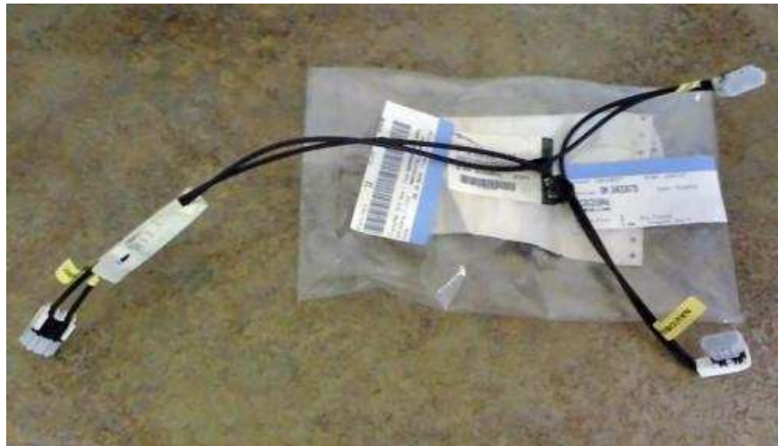
A Jaguar supplied cable with 3 connectors

So if your devices do not work first check you have a complete circuit and that the INs and OUTs are all correctly feeding the remainder of the loop.