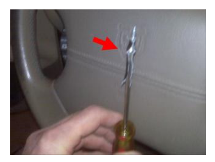
JUST DO IT! It is not that hard and the price is ... Your TIME + 4 Bulbs.